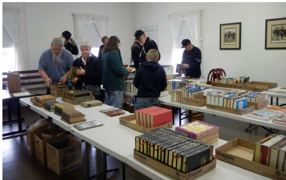
Duplicate and excess books not needed in the new Research Center were offered to the public at bargain prices. Funds help maintain the Center.